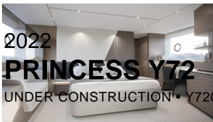
2022 PRINCESS Y72 UNDER CONSTRUCTION • Y72024